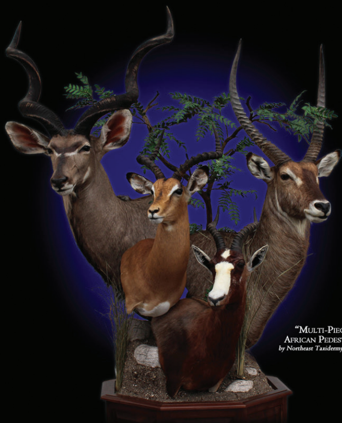
"MULTI-PIECE AFRICAN PEDESTAL" by Northeast Taxidermy Studios

770 Newfield Street • Middletown, CT 06457 Ph: 860-613-2067 • www.northeasttaxidermy.com joe@northeasttaxidermy.com